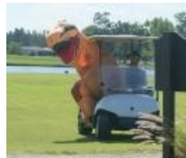
Big Brothers Golf