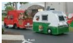
LABOR DAY CELEBRATION