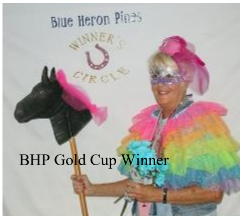
BHP Gold Cup Winner