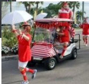
Golf Cart Parade